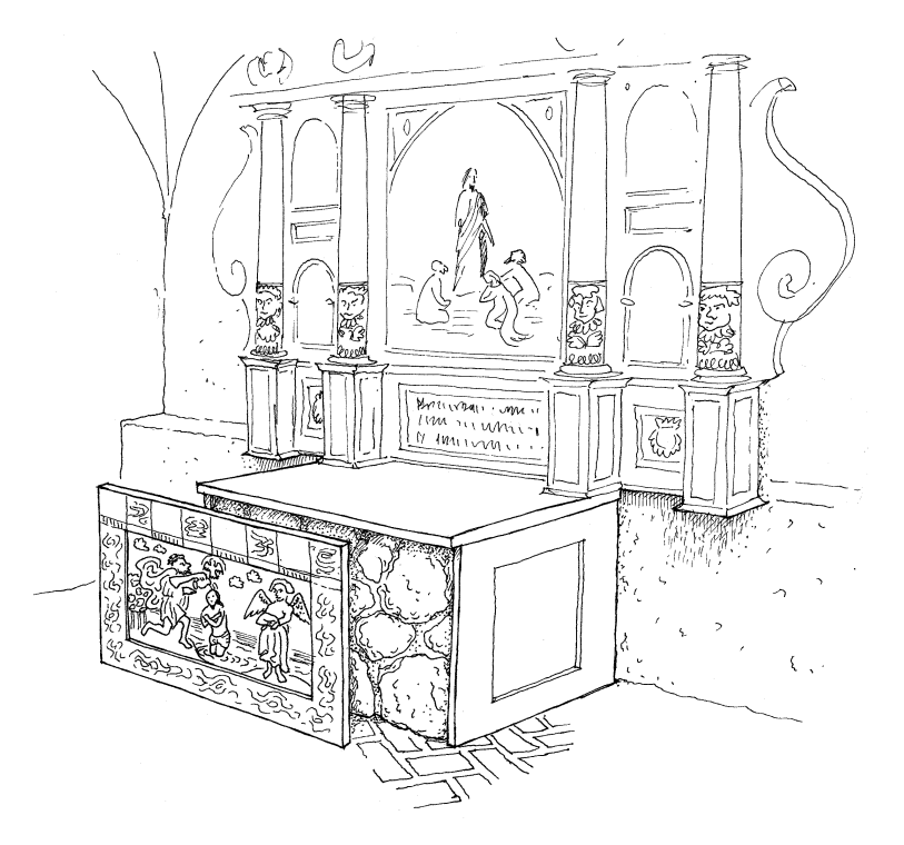
Figure 2. The altar of Gierslev church, Sealand, Denmark. The panel has been moved away to show the structure. The paint has hardened over wood that has always been exposed to a high relative humidity. The paint flaked when the panel was taken for repair to a workshop maintained at 55% RH.

This was a relatively benign example of a widespread phenomenon. The danger to historic buildings and to new museums, from this, often hidden, phenomenon is not always appreciated by architects and engineers. The apparently innocuous 50%RH standard is in fact a very unusual stress on a building's structure. We get a hint about how we should be designing new museums from the fact that old museum buildings made of porous brick or stone, without insulation, seldom suffer condensation damage. Now we run into the difficulty that the rest of the world has moved on. It is normal practice to specify an air barrier in modern construction, and an air barrier is often specified in reconstruction. The unconsidered use of modern materials, techniques and standards is at least as great a threat to old buildings as is neglect.